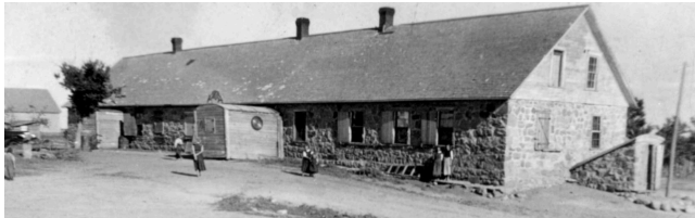
Huron Colony kitchen, still in use today.

The history of Huron Colony is a bit fuzzy, perhaps because it had three names (Huron, Beadle & Byron), so bear with us. In 1906, 10 families from Bon Homme Colony established the homesite. In 1918, its members sold the property and migrated to Canada, forming Huron Colony (MB). At some point, the Dariusleuts moved in but sold the property in 1935 to move to Montana. The Huron Colony we know today came from Jamesville Colony in 1945. Today, Huron Colony raises hogs, crops, and turkeys. Huron Colony has three daughters: Hillside, Fordham, and Shamrock.