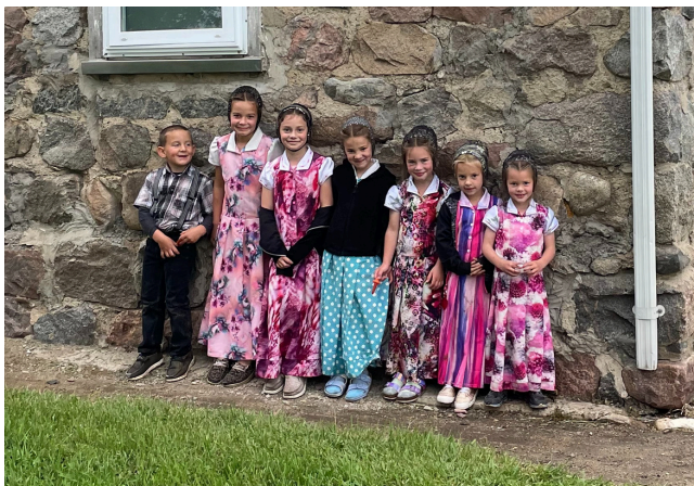
The next generation of Huron Colony.