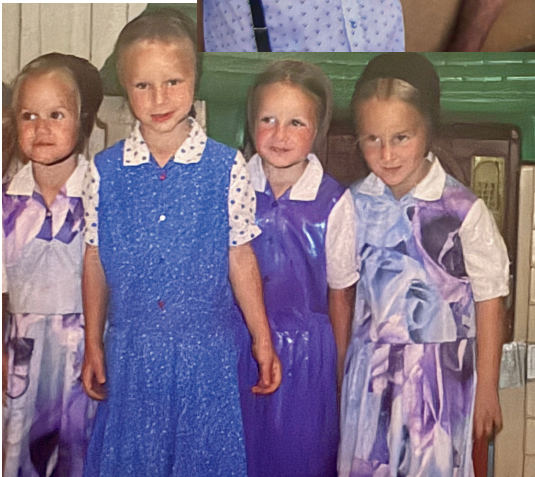
Glendale girls playing house.